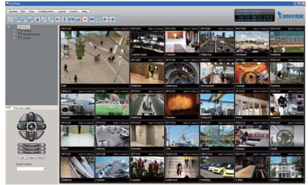
32-channel Live Video Monitoring